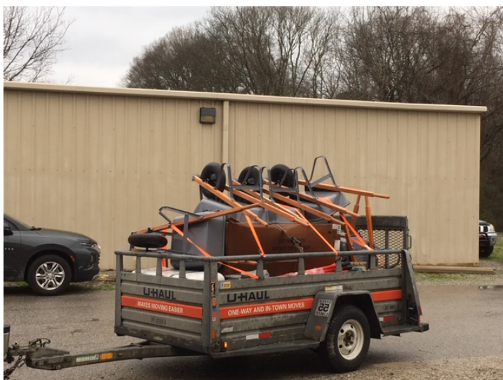
Donated Supplies for Pay It Forward Bahamas

This is our 1st newsletter in 2020. In January tarps, tornado buckets and wheel barrows were shipped to the communities of Lexington and Green Hill AL after a storm struck these areas. In February building supply donations collected by the warehouse were distributed to the Pay it Forward project, this project provides supplies and funds to rebuild homes destroyed in the Bahamas by Hurricane Dorian. A devastating tornado outbreak struck middle Tennessee in early March. We made multiple shipments of tornado buckets, cleaning buckets, tarps, wood strips, nails, wheel barrows and other supplies to locations in Nashville and Cookeville. The shower trailer just returned from PCB was immediately re-deployed to Nashville. In March we made a shipment of birthing kits, medical supplies and infant clothing to Hearts for Haiti in Cadiz KY. This shipment will go on a container bound for Haiti. These supplies will be used in the mid wife class sponsored by Eglise Methodiste d' Haiti planned for July 2020. Volunteers worked hard to get the Ahmen spring container staged, loaded and shipped by the end of March. The warehouse donated wheel chairs, linens, 4 gallon buckets and medical supplies. The container made it to Cruzadas in Honduras April 8th! Wide spread storms in April devastated communities across the Southeastern US. We shipped tornado buckets, cleaning buckets, tarps, wood strips, rakes, shovels and other relief supplies to Laurel MS and to Walker and Etowah counties in AL.