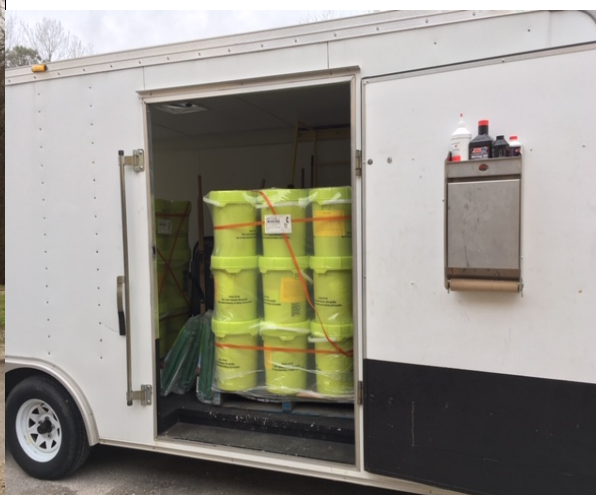
Supplies going to Cookeville TN