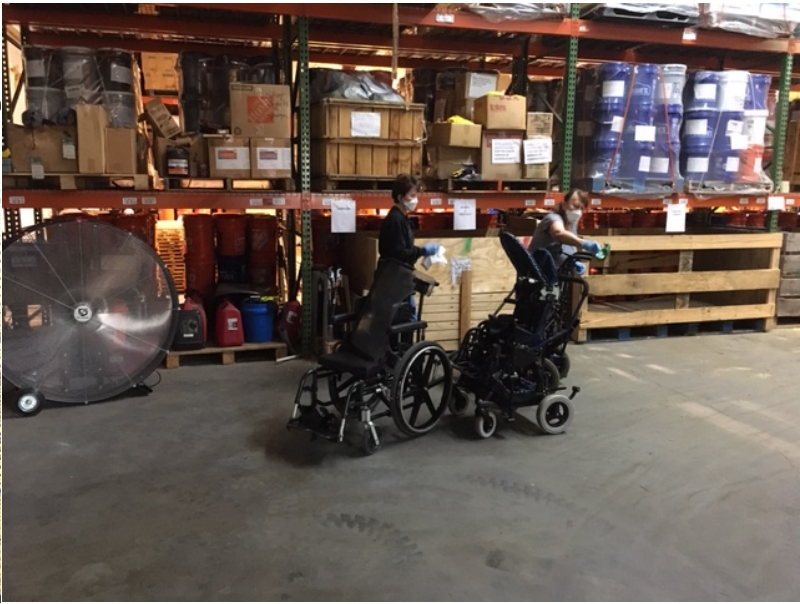
Wheel chairs donated by the warehouse for Honduras