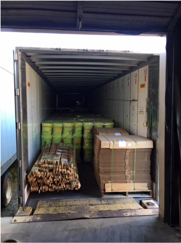
Supplies shipped to Laurel MS