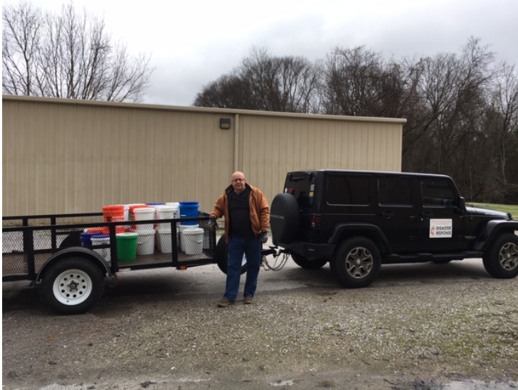
Cleaning Buckets from the UMC South Georgia Conference

The Decatur warehouse received donations of Tornado Buckets, Cleaning Buckets, Health Kits, School Supplies and Birthing Kits during the 1 st quarter of 2020. A Big Thank You to churches, volunteer groups, individuals and conferences that support our warehouse!