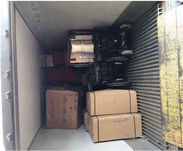
Ahmen Container shipping to Honduras